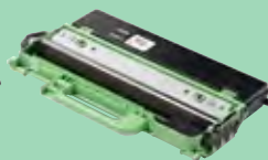
Waste Toner Box WT229CL