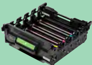
Drum Unit DR625CL