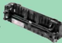
Fuser Unit FD-5000